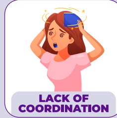
LACK OF COORDINATION